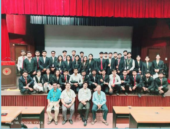
Bar Council of India Visit